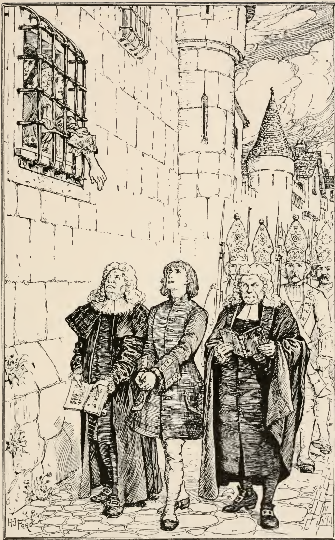
FREDERICK BIDS FAREWELL TO KATTE